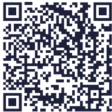
MANGO POWER App

The MANGO POWER app allows you to remotely control your device, giving you peace of mind no matter where you are. Scan the QR code to download the app and get started.